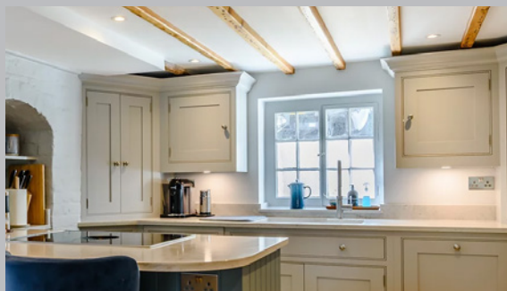
Full refurbishment and extension in Guildford

We undertake any building work, large or small. We offer high quality work with attention to details. If you have a project or dream for your home, we would love to help you make it happen.