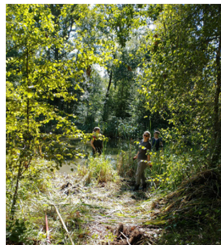
Removing reeds and lopping back willows

Common working on the permissive horse path to cut back some of the bramble and bracken alongside the path, widening it for users and hopefully encouraging a greater diversity of plants to grow there.