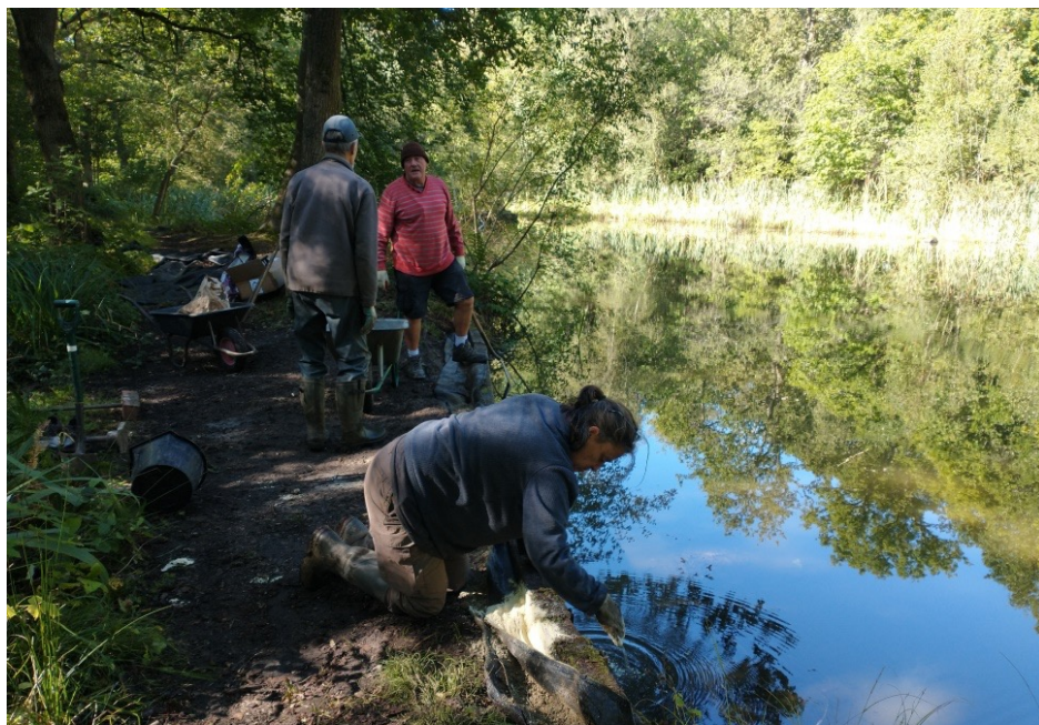
Fixing the leak in the pond.

The edge of the pond is now leak-proof which means the path is no longer a puddle or stream for much of the winter.